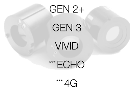
IMAGE INTENSIFIER TUBES

Autogating and White Phosphor options are available with selected tubes. Contact us for more details.